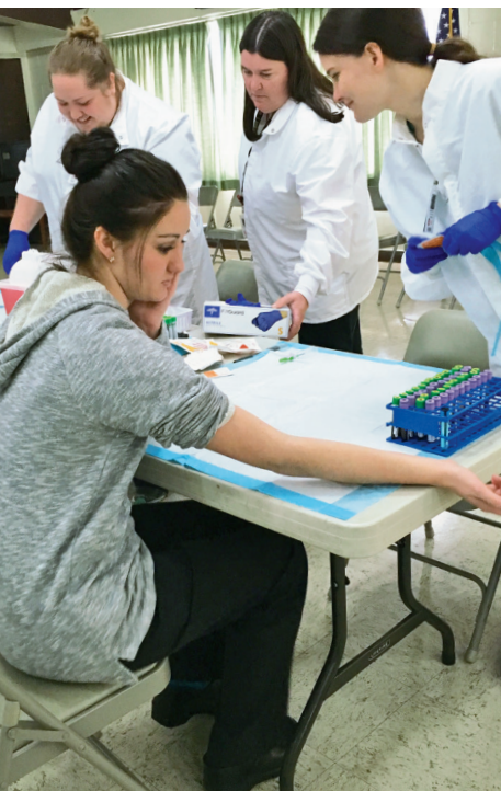
GRH blood draw at Elgin Community Center on Feb. 6, 2016

IN FEBRUARY 2016 , staff from the Grande Ronde Hospital (GRH) Laboratory and Community Relations departments organized, promoted and staffed free community blood draws on three Saturdays.