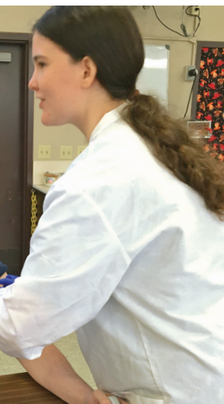
GRH blood draw at Union County Senior Center on Feb. 27, 2016