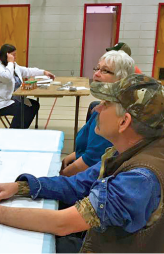
GRH blood draw at S.E. Miller School on Feb. 20, 2016