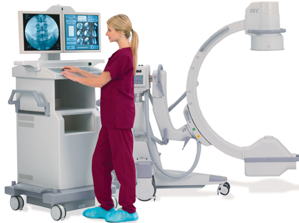
The new mobile C-arm purchased in 2014 by the Foundation for enhanced imaging capabilities in the hospital's Radiology and Surgical Services Departments.

In 2014, the Foundation dedicated over $235,000 toward the purchase of patient care equipment at GRH.